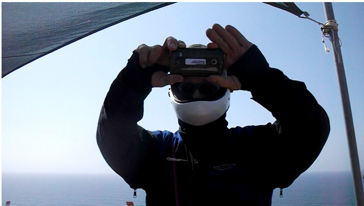
Exhibit 2 (b): Plaintiff's employees filming Defendant/Respondent at Torrey Pines Gliderport 2013