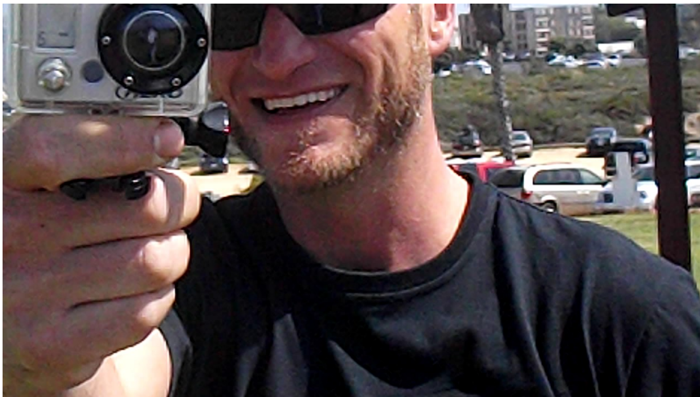
Exhibit 1 (b): Plaintiff's employees filming Defendant/Respondent at Torrey Pines Gliderport 2013