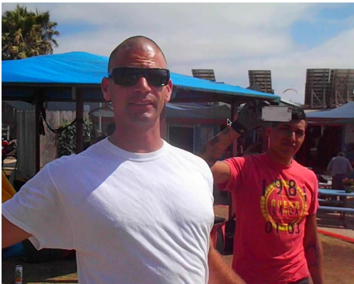
Exhibit 3 (b): Plaintiff's employees filming Defendant/Respondent at Gliderport March 8, 2015