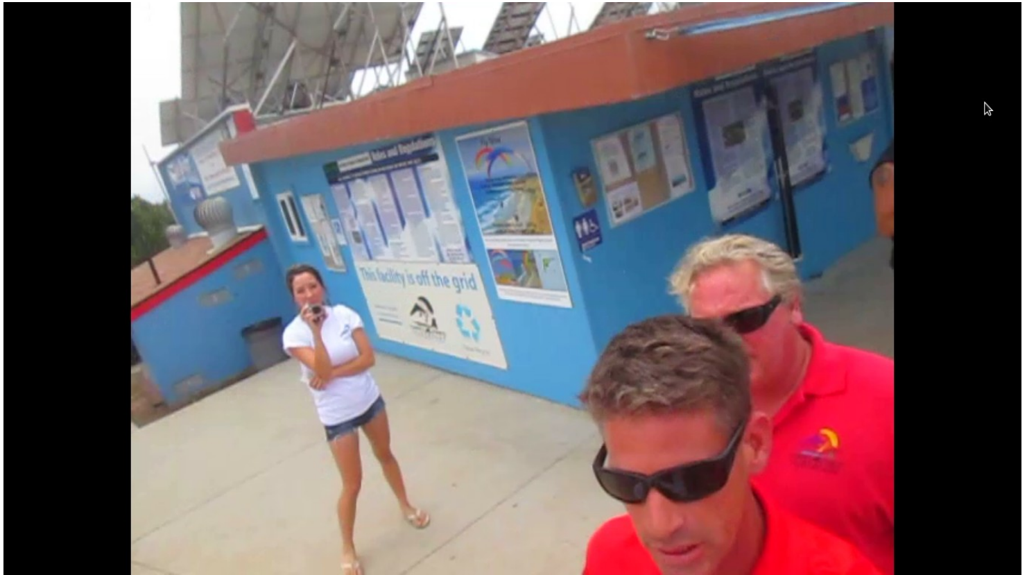
Exhibit 4 (b): Plaintiff's employees filming Defendant/Respondent at Gliderport June 14, 2015