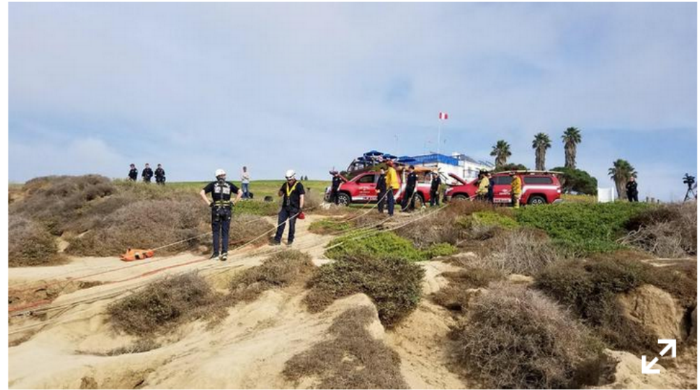
Rescuers were using ropes to pull an injured man up the cliffs to the San Diego Gliderport in Torrey Pines.