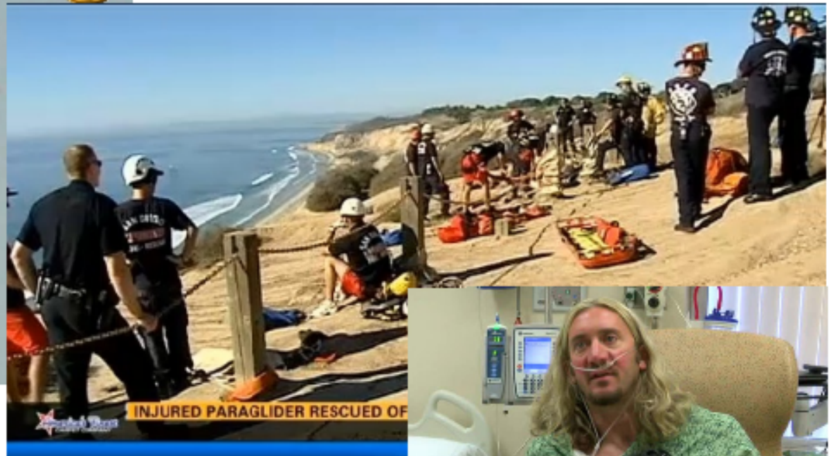
INJURED PARAGLIDER RESCUED OF