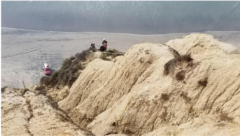
Firefighters and lifeguards rescued a man who apparently crashed his paraglider into a cliff.